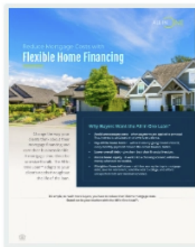
Buyers Agents #1