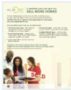
Listing Agents #1